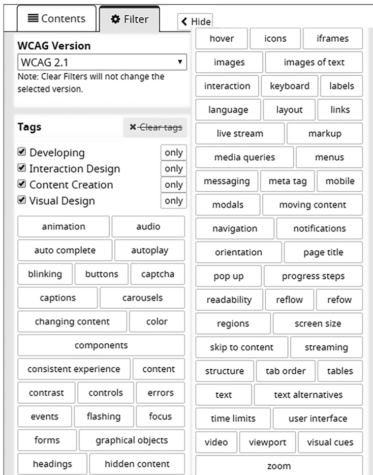
Figure 1. Filter options when consulting guidelines and success criteria of WCAG 2.1 7

7