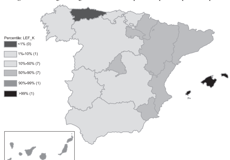
Figure 2. Long-run regional effects from public capital on private capital

The values of I for five of the six different effects were well below the expected value for this statistic under the null hypothesis of no spatial correlation. It appears that these effects are not spatially correlated, since their statistics are not significant. Nevertheless, for the case of the long-run effects of public capital on private capital, the Moran's I reveals the existence of a strong and statistically significant degree of positive spatial dependence in the distribution of regional effects. Figure 2 shows the spatial distribution of long-run effects of public capital on private capital. Figure 3 provides a clearer view of the spatial autocorrelation in these regional effects through the Moran scatterplot, showing a strong geographic pattern and revealing the presence of positive spatial dependence.