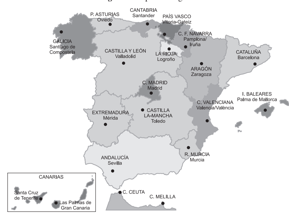
Figure 1. Spanish Regions

economic geography. Traditionally, the peninsular economic periphery is comprised of Castilla-León, Castilla-La Mancha and Extremadura while Madrid, País Vasco, Cataluña and Valencia make up the economic core. Galicia, Andalucía, Murcia, Islas Baleares and Islas Canarias are also considered as «peripheral» regions; while Navarra, La Rioja, and Aragón may be considered as «core» regions. Finally, Asturias and Cantabria are historical «core» regions, but currently experiencing significant industrial restructuring processes.