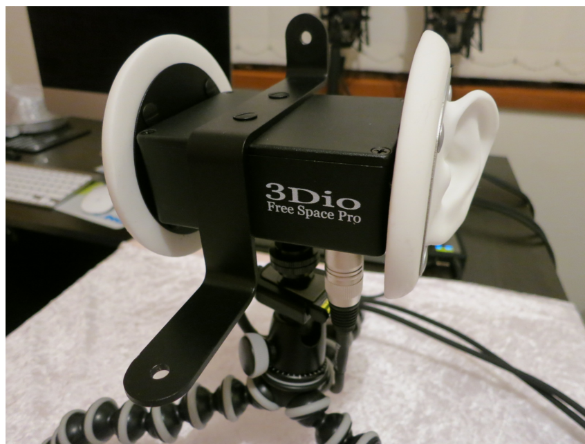
Fig. 2. 3Dio's Free Space© device.

The method of recording binaural sound uses two microphones in a mock head with two ear-shaped pinnae, simulating the ear's natural position, creating an ear spacing or "head shadow" from the head to the ears. In fact, the student perceives Interaural Time Differences (ITDs) and Interaural Level Differences (ILDs). Adjustments (known as Head-Related Transfer Functions (HRTFs) are done automatically by the system itself. That means that sound is sequenced naturally as sound “involves” the human head and is adapted to the form of the outer and inner ear. The most often used commercial device is 3Dio Space Pro© developed 3Dio Company.