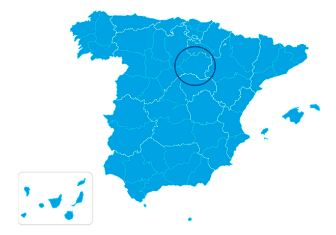
Figure 2. Map of Spain showing Soria province.

This research is based on a descriptive study using primary data from a questionnaire used on a representative sample of tourists over 18 years old who visited the province of Soria (Spain) and stayed in a rural tourism establishment. As you can see in Figure 2, the province of Soria is located in the north of Spain, east of the Autonomous Community of Castile and León and just two hundred kilometers from Spain's capital, Madrid. It has a very diverse landscape, as well as countless historical and archaeological sites. It is the province of Spain with the lowest number of inhabitants (88,636 inhabitants in 2019). It is also the province that receives the second-lowest number of tourists in the entire country (233,203 tourists in 2019).