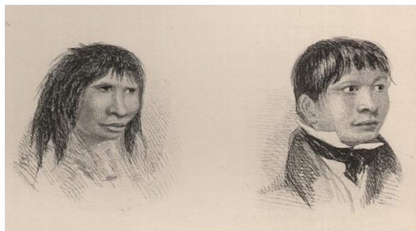
Jemmy Button before and after his journey to England. Robert FitzRoy (c. 1830-1834)