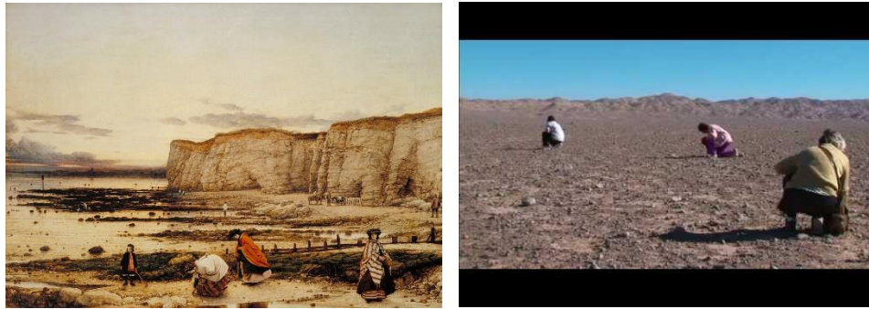
From left to right, William Dyce, Pegwell Bay, Kent—a Recollection of October 5th 1858 and the “Mujeres de Calama” in Nostalgia de la luz