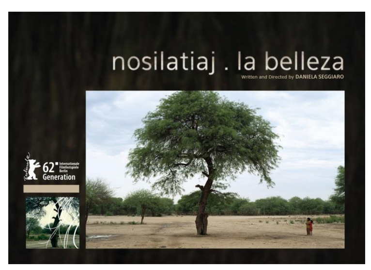
Fig. 6 Beauty

In the image above, the camera moves backwards and the image of the landscape becomes thick and unfathomable, preventing the viewer from seeing through the landscape and thus decoding nature. As we can see in Fig. 6, one of the movie's film posters shows nature from a variety of perspectives: