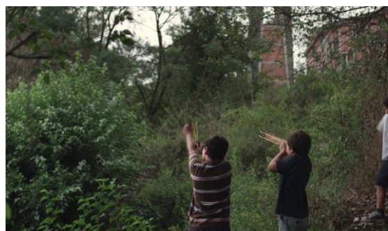
Fig. 7 Beauty