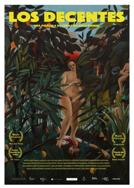
Fig. 15 A Decent Woman

it also reinforces the differences between two systems or opposed lifestyles, which leads to the final catastrophe and to consideration of the question of the constitution of decent/indecent in current urban society. This idea of "decency" in the film is also entangled with a dominant Catholic idea of purity and cleanliness, and in this regard, it is revealing to take a look at one of the film posters (Fig. 15):