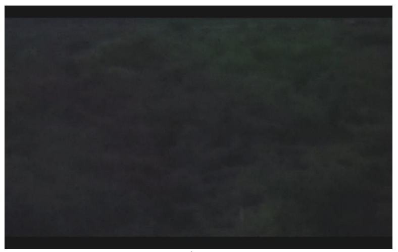
Fig. 5 Beauty

In the image above, the camera moves backwards and the image of the landscape becomes thick and unfathomable, preventing the viewer from seeing through the landscape and thus decoding nature. As we can see in Fig. 6, one of the movie's film posters shows nature from a variety of perspectives: