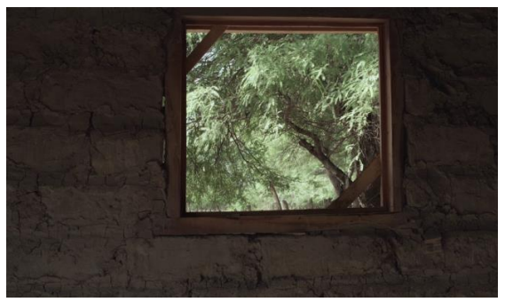
Fig. 3 Beauty