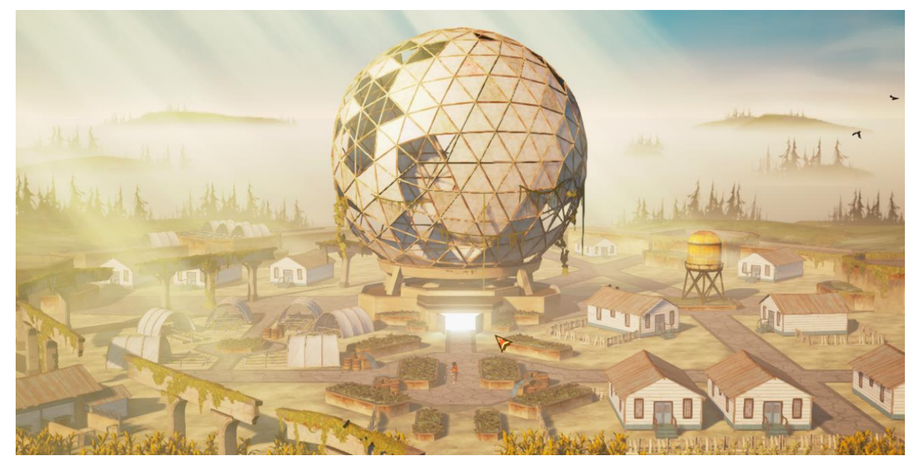
Fig. 1: The Kingdom, The Flame in the Flood, 2016

The rhetorical implications of this remediation of the theme park into a functional living space, essentially a farm, is intriguing. That Western culture's most flagrant consumer fantasy lives on in this life-giving form is an odd reversal. It appears sustainable, out here in the middle of the Gulf, but perhaps in part because the nature of theme parks, it also feels too comfortable, too disturbingly perfect in its anthropocentricity. As Jean Baudrillard famously writes,