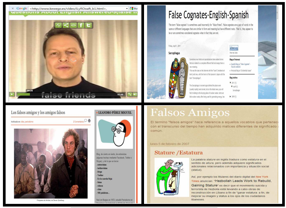
FIGURE 2: Videos and blogs of False Friends